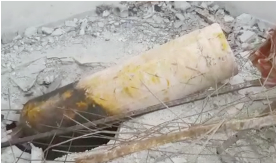
Gas cylinder in Douma

that the OPCW issued on 1 March and the ‘engineering assessment’ leaked in May 2019 centred on the provenance of these two cylinders. How had they got to where they were photographed on 8 April and where they were later inspected by the Fact Finding Mission?