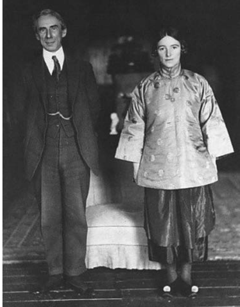
Bertrand Russell and Dora Black in China

Russell and Dora duly arrived in China whilst this huge country was in the midst of great changes and seeking direction. Science and democracy were high on Russell's list of personal priorities; democracy in the workplace figured centrally in Russell's quest for creative impulses as described in Principles of Social Reconstruction , written in 1915 in response to the unfolding horrors of the First World War, delivered early in 1916, and first published that year under the same title. Had this work been noticed by Chinese scholars?