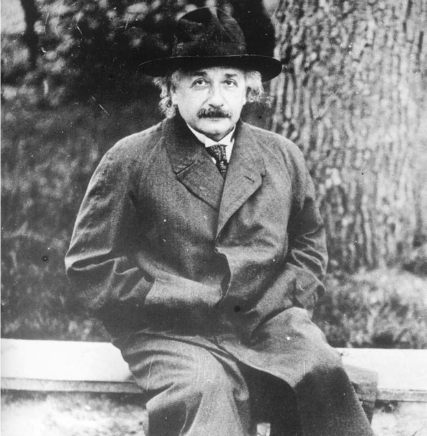
Albert Einstein followed Russell to China in 1922, albeit briefly.