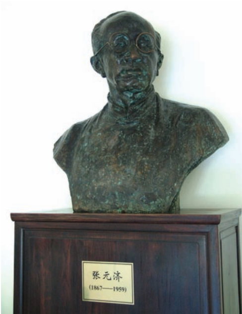
Zhang Yuanji's memorial at Commercial Press, Beijing

development. This process gathered pace with the collapse of the Qing dynasty in 1911. It was accelerated further by the First World War and what followed. The old order was passing.